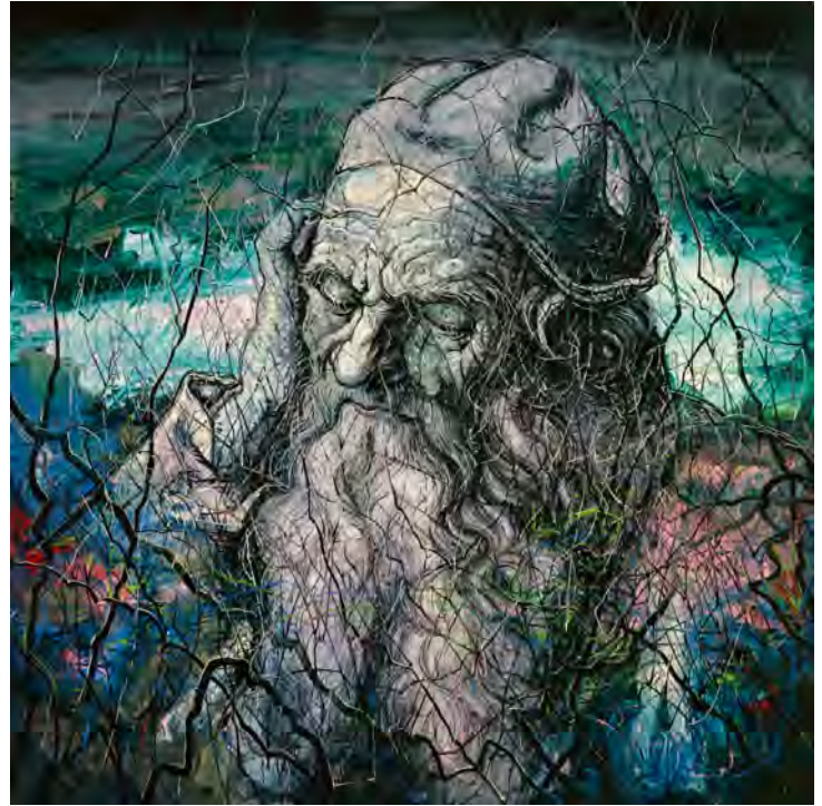
Zeng Fanzhi, Head of an Old Man , 2012, oil on canvas, 400 x 400 cm © Zeng Fanzhi Studio

At the center of this exhibition lie a monumental group of four-meter square paintings which combine images from key moments in Western art history with Zeng Fanzhi's signature chaotic brushstroke motif and palette. These seven works, which occupy the slender, serial walls that form the core of Tadao Ando's design for this exhibition, are presented not in the order in which they were painted, but of the creation of the source image around which each resolves. Beginning with an image of the head of the titular figure in the ancient Roman sculpture Laocoön and His Sons whose public display marked the origins of the Vatican Museums during the Renaissance, the sequence proceeds through two paintings based on works by Leonardo da Vinci (1452-1519), and four based on works by Albrecht Dürer (1471-1528). These daunting compositions function less as appropriations than homages: in their intricate brushwork and mimetic prowess, we see