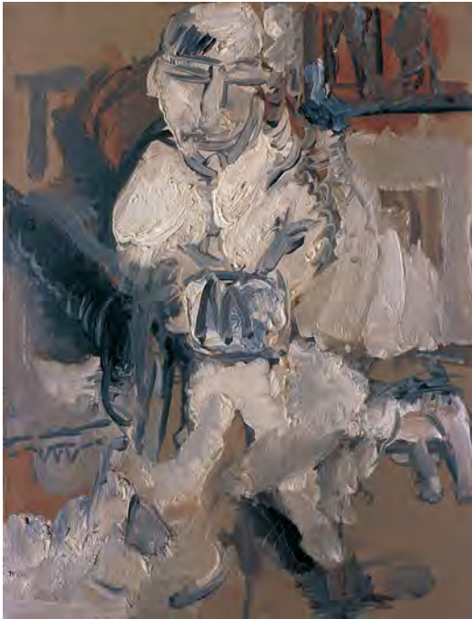
Zeng Fanzhi Parcours , 1990 Oil on canvas, 41 x 32 cm

Completed during the interim of his last years at Hubei Institute of Fine Arts (1987-91) in his hometown of Wuhan, Zeng Fanzhi's early works in oil on canvas convey the struggle of a young artist groping thematically and stylistically for forms that express the angst characteristic of that historical period. Remarkably, they also contribute to the larger discourse of figurative painting in China at the time. The pale, frenetic phantom of Parcours (1990) seemingly shrugs off the brushstrokes that compose him. Compositionally reminiscent of Francis Bacon's Study after Velázquez's Pope Innocent X (1953), the most sinister of these images, Agony (1990) fuses the sitter in red with his chair, rendered in long, frustrated slashes of ochre. In canvases Dusk 1 (1990) and Dusk 2 (1993), Zeng's gradual shift towards a mature style becomes apparent, the enlarged hands and penetrating gaze of figures continuing as a trademark for years to come.