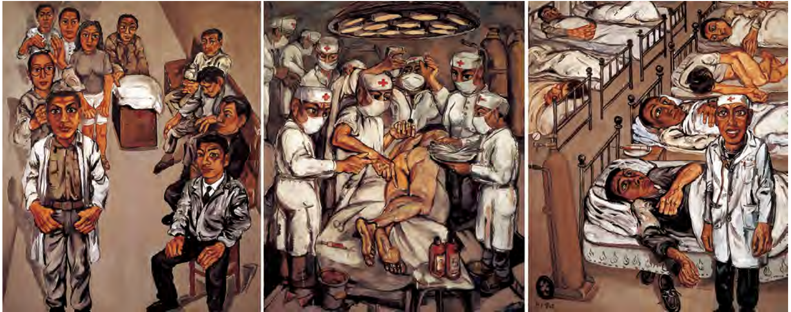
Zeng Fanzhi, Hospital Triptych No. 1 , 1991, oil on canvas, 180 x 460 cm © Zeng Fanzhi Studio

Realized in 1991 and 1992, the “Xiehe Hospital” series—and particularly the three triptychs with which it culminates—marks the emergence of Zeng Fanzhi’s mature style. These were completed just before his experiments in the “Meat” series, and if they share with that earlier effort a singular focus on the carnality of daily life, they add layers of social observation and rigorous composition. The two triptychs on view here contain 26 and 29 figures respectively, arrayed in configurations that evoke renaissance religious paintings, the gritty realist tableaux of Thomas Hart Benton and Thomas Eakins, and the tripartite imagistic grammar of Francis Bacon. These works, included in the landmark exhibition “China’s New Art: Post-1989” which began in Hong Kong in early 1993 and subsequently toured to Australia and throughout the United States, were instrumental for the critic Li Xianting’s formulation of his concept of “Cynical Realism.” In a seminal 1992 essay