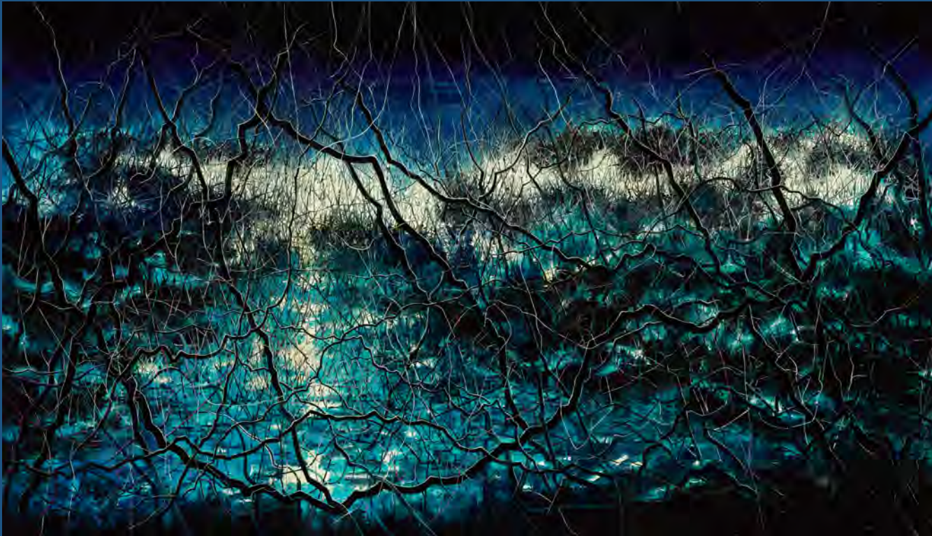
Zeng Fanzhi Blue , 2015 Oil on canvas, 400 x 700 cm © Zeng Fanzhi Studio

The technical difficulty of this series lies in the question of how to allow an intricate network of abstract lines to “breathe” without being rigid, while at the same time guaranteeing their fluidity, certainty, and continuity. In order to accomplish this, Zeng makes extensive use of a “wet technique.” This technique requires precise planning as well as maintaining a balanced and efficient painting speed. Paint must be mixed so as to extend its drying time. Zeng tends to think for a long time before starting on a painting, but then to complete it in one fell swoop. He outlines an image, colors it, and then begins the long process of deconstructing it with his signature chaotic brushstrokes. Ultimately, this results in a canvas that can be seen differently depending on where one stands: from afar, an image appears clear, becoming blurred as one approaches until it disappears entirely into a flurry of line. The play between these layers of visual information makes for works that are at once abstract and figurative, impressionistic and expressionistic.