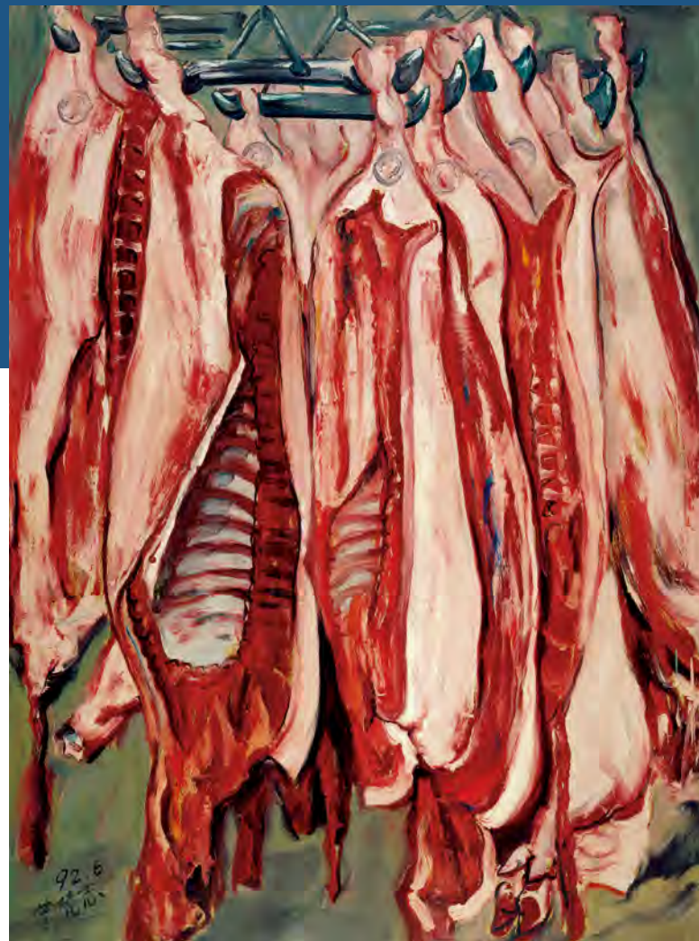
Zeng Fanzhi, Meat , 1992, oil on canvas, 130 x 95 cm