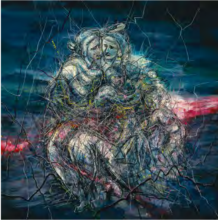
Zeng Fanzhi, Twin Goddesses , 2012, oil on canvas, 400 x 400 cm © Zeng Fanzhi Studio

At the center of this exhibition lie a monumental group of four-meter square paintings which combine images from key moments in Western art history with Zeng Fanzhi's signature chaotic brushstroke motif and palette. These seven works, which occupy the slender, serial walls that form the core of Tadao Ando's design for this exhibition, are presented not in the order in which they were painted, but of the creation of the source image around which each resolves. Beginning with an image of the head of the titular figure in the ancient Roman sculpture Laocoön and His Sons whose public display marked the origins of the Vatican Museums during the Renaissance, the sequence proceeds through two paintings based on works by Leonardo da Vinci (1452-1519), and four based on works by Albrecht Dürer (1471-1528). These daunting compositions function less as appropriations than homages: in their intricate brushwork and mimetic prowess, we see