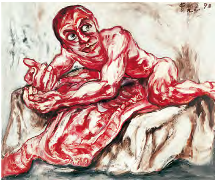
Zeng Fanzhi, Meat , 1993, oil on canvas, 50 x 60 cm © Zeng Fanzhi Studio

At the beginning of 1992 while still living in Wuhan, Zeng Fanzhi began producing the “Meat” series. Here, heavy, exaggerated strokes of red and white compose the fleshy bodies of individuals that appear juxtaposed with slabs of pork and beef. Within this grouping, Nativity (1992) is most akin to the “Xiehe Hospital” paintings, the naked baby and other figures forming a direct allusion to the Christian nativity scene. Zeng plays on the visual slippage between hospital patients seen lying on white sheets and raw meat strewn about a butcher shop. Here, restrained bodies relate pathologically to greater systems of power, and a dark set of emotions mixed with despair reflects the general climate of the moment. The influences of German and American expressionism are especially felt throughout these works. While exploring painterly form in his early period, Zeng often turned to Max Beckmann and the early canvases of Willem de Kooning to study their brushwork. He states, “I tried to recreate their works, deeply inspecting how each was accomplished. With each copy, I discovered more of the tiny elements that truly characterize me as an artist.”