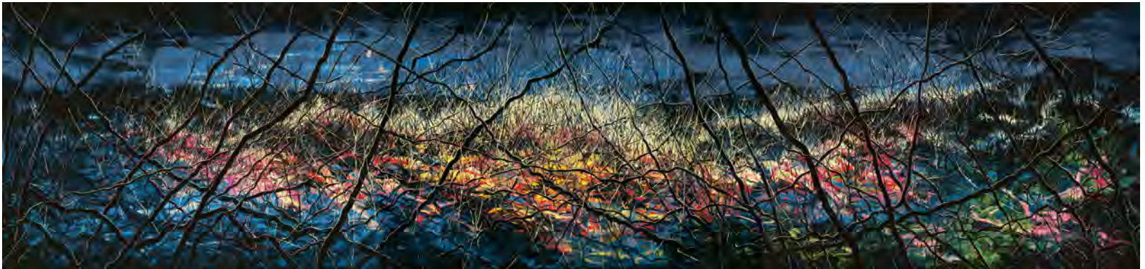
Zeng Fanzhi, This Land So Rich in Beauty No. 2 , 2010, oil on canvas, 250 x 1050 cm © Zeng Fanzhi Studio