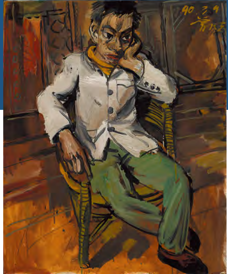
Zeng Fanzhi A Man in Melancholy , 1990 Oil on canvas, 100 x 90 cm