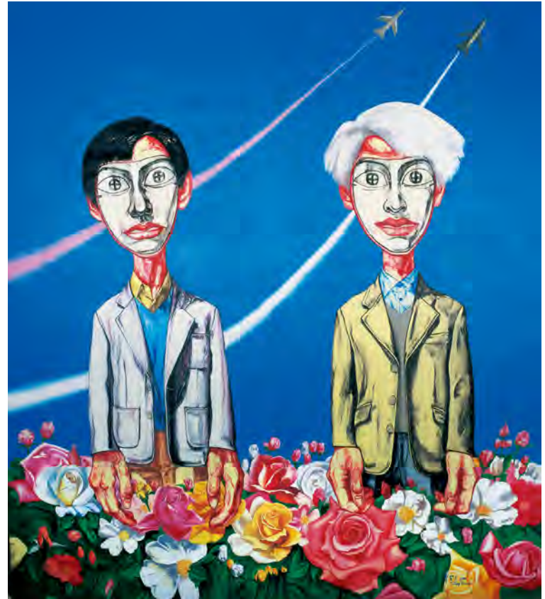
▶ Zeng Fanzhi Fly , 2000 Oil on canvas, 200 x 180 cm

After 2000, Zeng adopted new techniques and methods to explore the field of portraiture, attempting to highlight “line” through form and content. In We (2002), he studies the “features” of a figure’s face, painting layered sequences of spiraling lines that achieve a thick tactility. These destructive lines also give the painting a “mask” of its own and an accidental aesthetic beauty. In this period, Zeng explored an experimental language of painting that hints at future works in the “Abstract Landscapes” series.