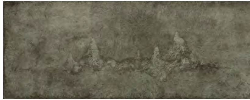
Zeng Fanzhi, Untitled , 2016, handmade paper, mixed media, 30 x 78 cm © Zeng Fanzhi Studio