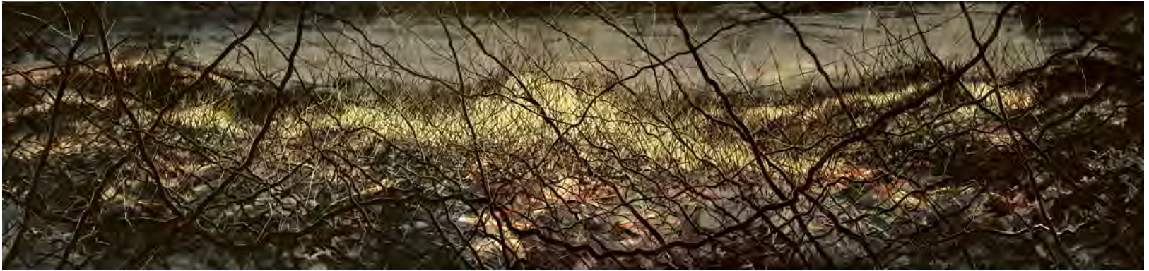
Zeng Fanzhi, This Land So Rich in Beauty No. 1 , 2010, oil on canvas, 250 x 1050 cm © Zeng Fanzhi Studio

between the deathly stillness that follows a blaze and the abundant life that precedes it. The title of this series is taken from a line in Mao Zedong's 1936 poem "Snow," later used as the title of the large landscape painting by Guan Shanyue and Fu Baoshi that has hung in the Great Hall of the People since 1959. That earlier painting, a touchstone of Chinese art after 1949, was made both in praise of their country and as an expression of the artists' great hopes for the Chinese nation. In using a title of great historical significance, Zeng is not only incorporating his personal views and artistic principles into the landscape, he is also alluding to the ideology behind the "grand narrative" that is promoted, knowingly or otherwise, by so much artistic creation in China.