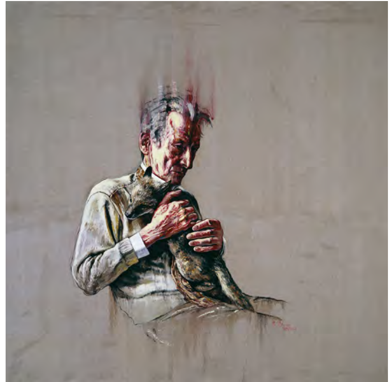
Zeng Fanzhi, Lucian Freud, 2011, oil on canvas, 180 x 180 cm