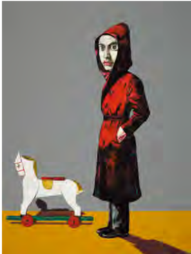
◀ Zeng Fanzhi Portrait , 2004 Oil on canvas, 200 x 150 cm © Zeng Fanzhi Studio