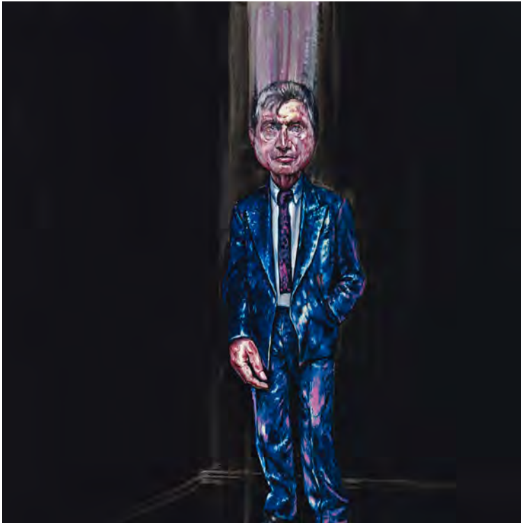
Zeng Fanzhi, Bacon , 2010, oil on canvas, 220 x 180 cm © Zeng Fanzhi Studio